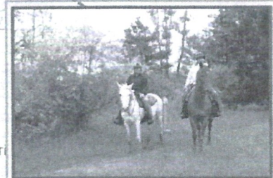
#4 Walborn Reservoir Trails