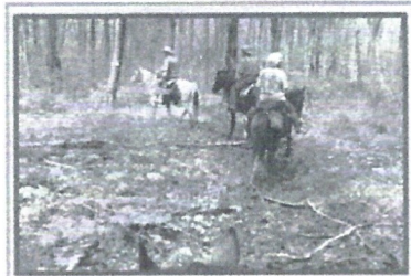
#2 Tri-County Horse Trails