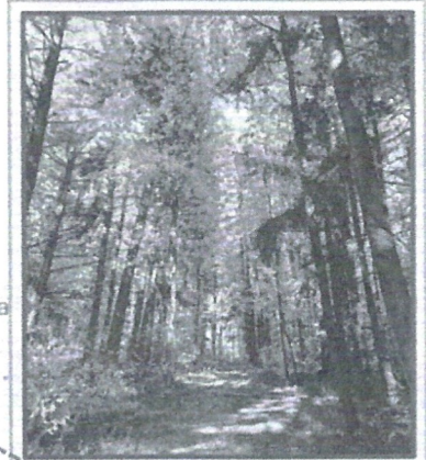
#3 Quail Hollow Horse Trails

Connect with Stark County Chapter Ohio Horseman's Council at Facebook: Stark County Ohio Horseman's Council | Facebook or email us at stark@ohconline.com