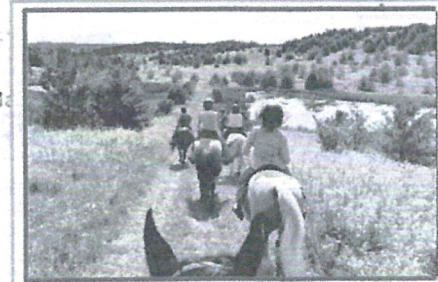
#5 Pike Ridge Horse Trails