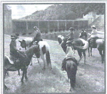
#6 Camp Tuscazoar Horse Trails